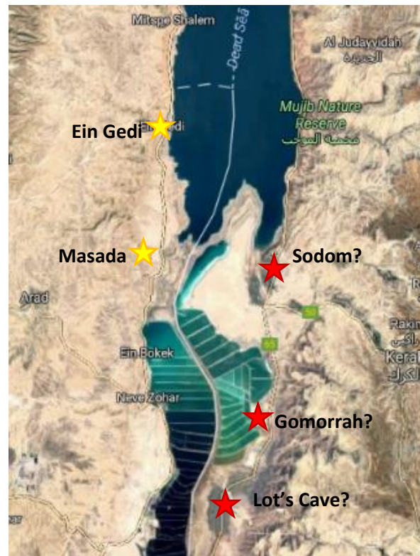
Notable locations around the Dead Sea